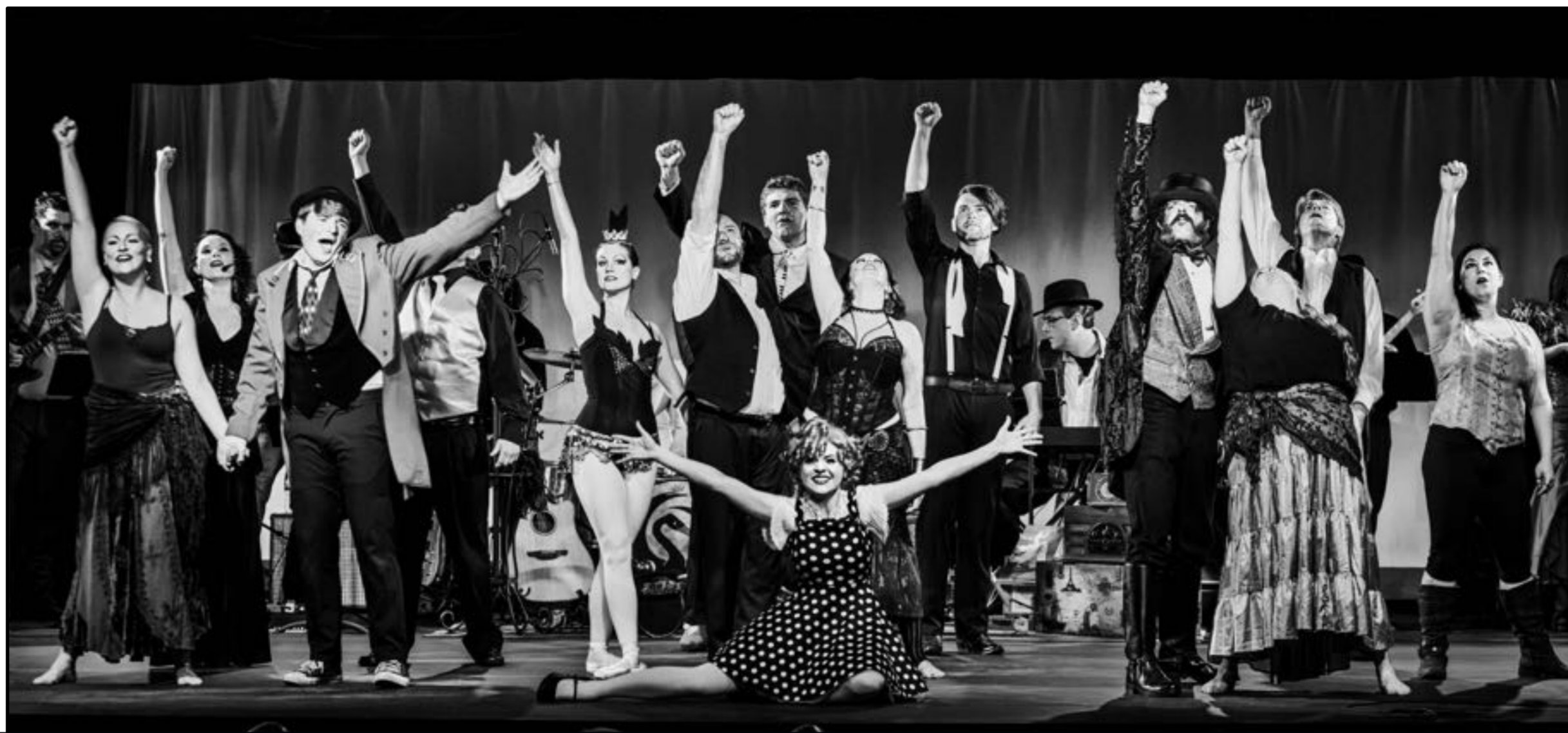
The Greatest Show... All Players