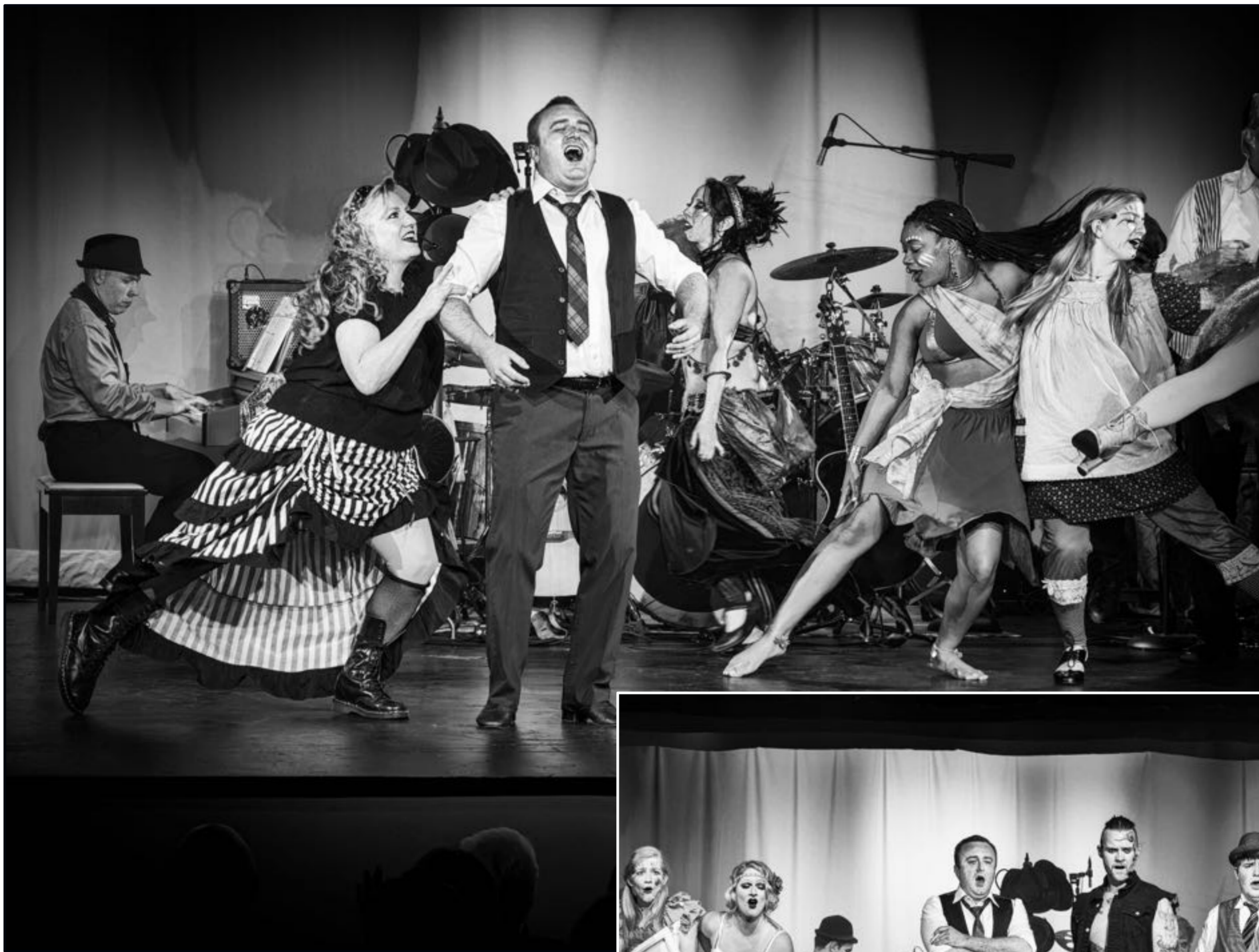
One Day More (The Troupe makes a stand)... All Players