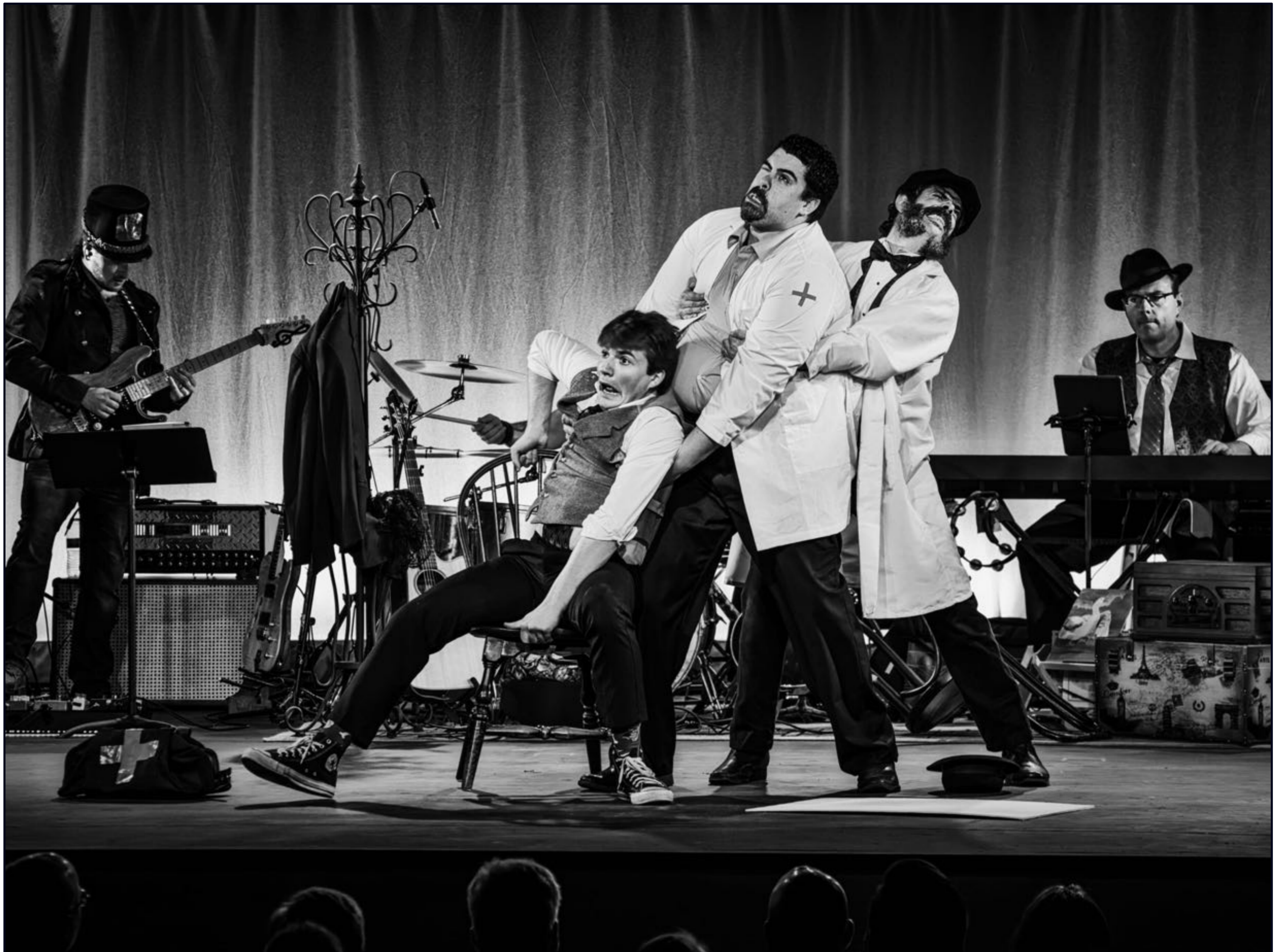
Chair Skit... the Comedic Cast