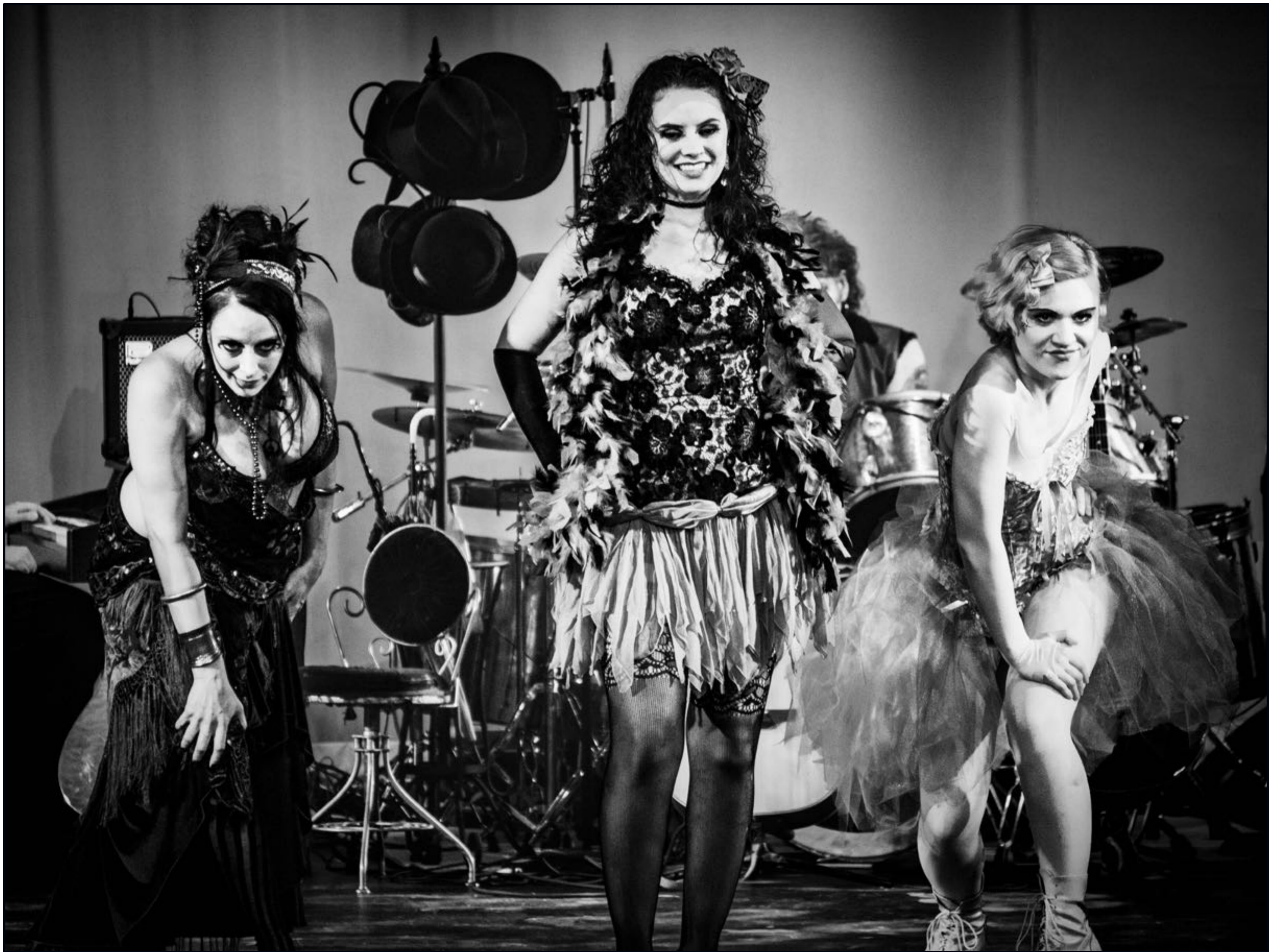
Big Spender... featuring the Lovely Ladies of Rogue Swan