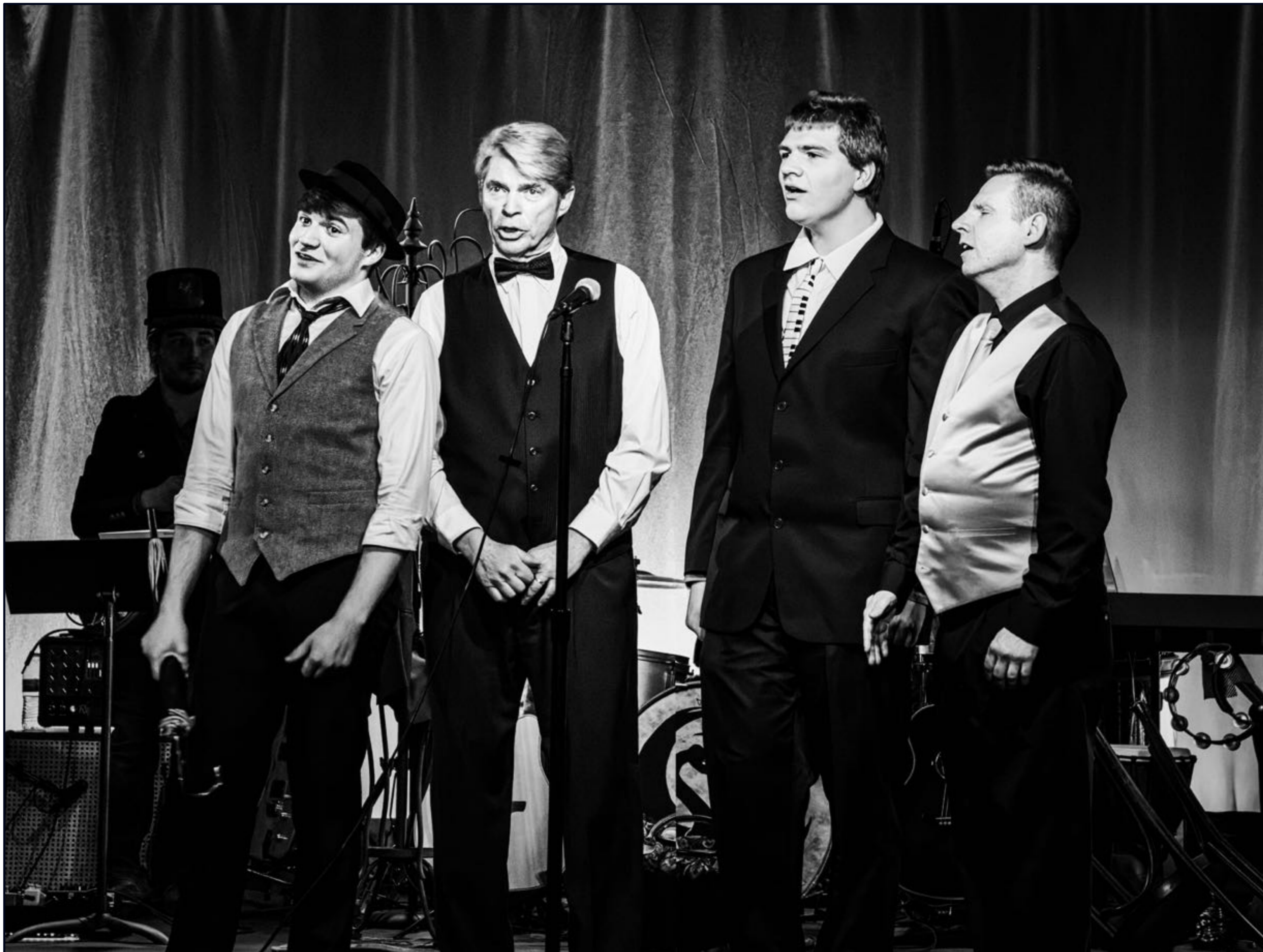
Coney Island... The Major Men