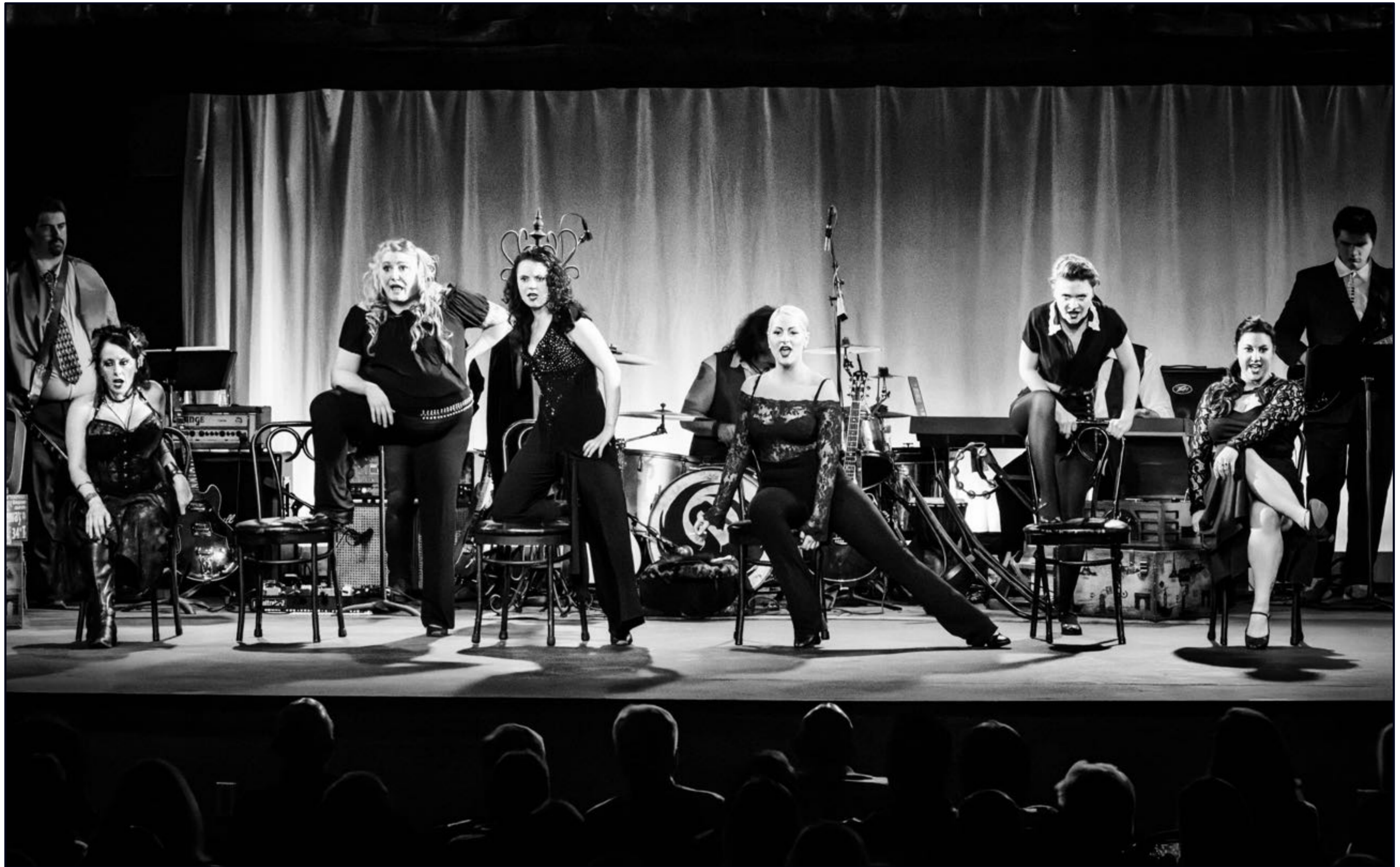
Cell Block Tango... The Six Merry Murderesses