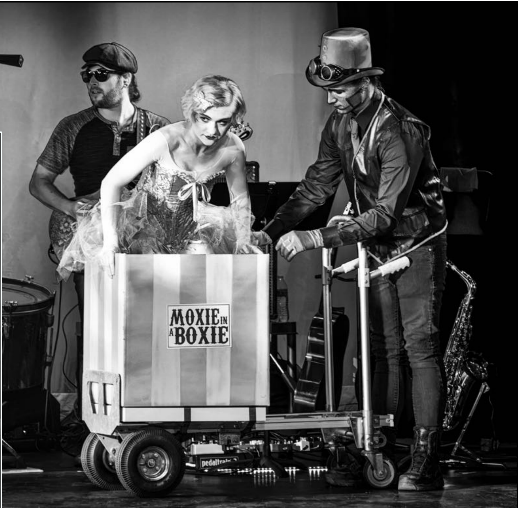
Parting Glass (The Last Call)... All Players